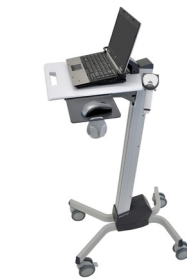
Neo-Flex Laptop Cart 24-205-214 two-tone grey