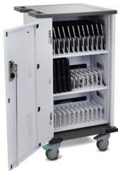
YES Basic Charging Cart YESBASGMPW4 white