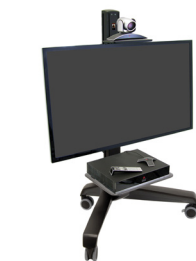
Neo-Flex™ Mobile MediaCenter LD (Light Duty) 24-190-085 black VHD (Very Heavy Duty) 24-191-085 black UHD (Ultra Heavy Duty) 24-192-085 black Camera Shelf Kit 97-491-085