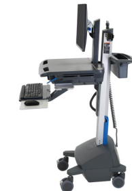
StyleView™ 42 Series LCD pivot version shown Powered with LiFe battery SV42-8302-1 dark grey