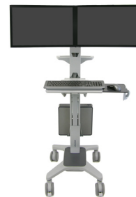
Neo-Flex WideView WorkSpace Dual LCD 24-194-055 two-tone grey