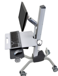
Neo-Flex LCD Cart 24-206-214 two-tone grey