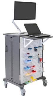
YES24 Adjusta™ Charging Cart YES24-CHR-1 white