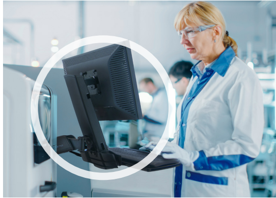
200 Series Combo Arm

With features designed to save time and maximize floor space, Ergotron's professional-grade solutions create flexible workspaces for warehouses, back office environments that support efficiency, employee well-being and overall productivity.