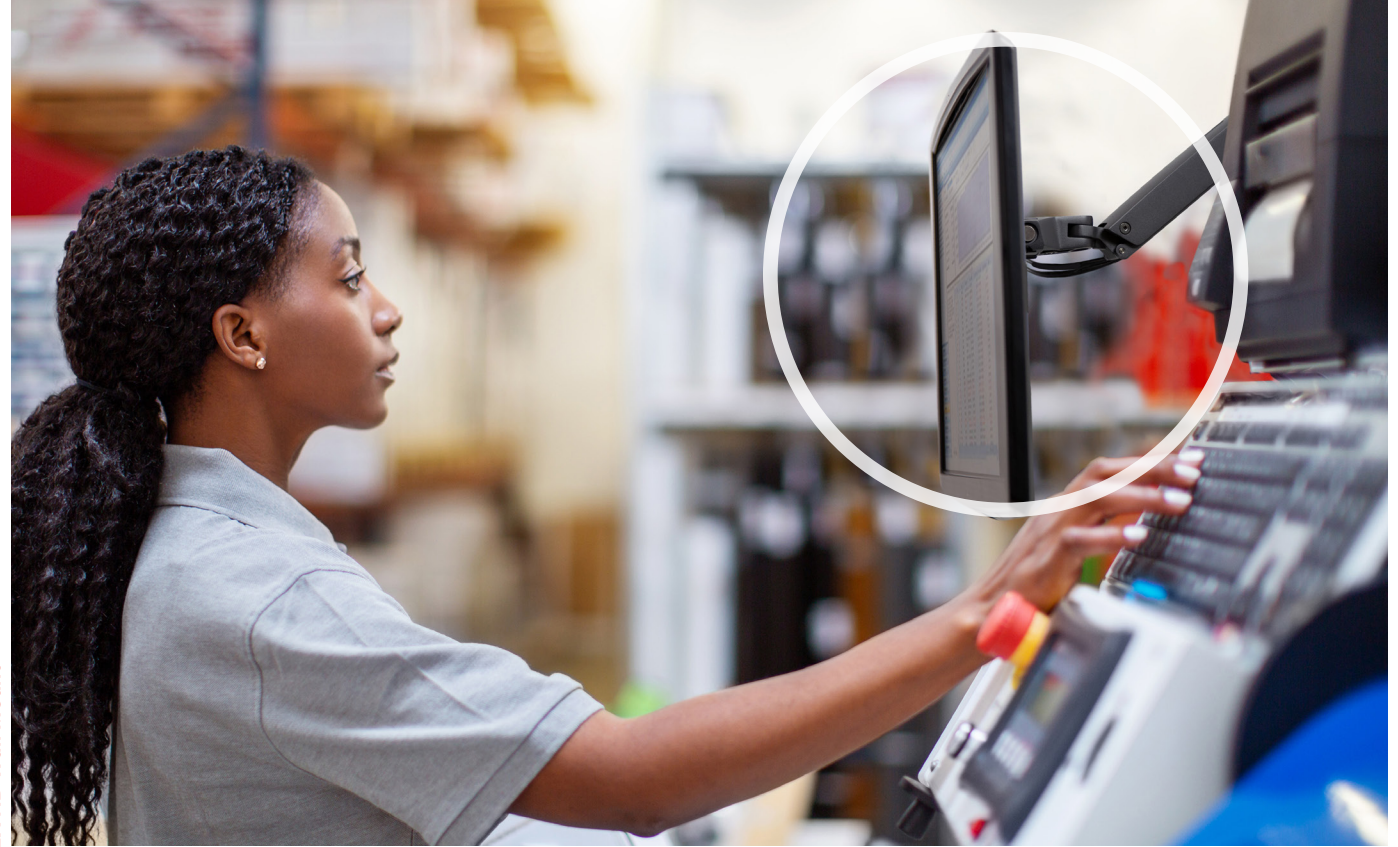
LX HD Wall Mount