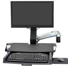
StyleView Sit-Stand Combo Arm Combo Arm with worksurface: 45-260-026 polished aluminum Combo Arm: 45-266-026 black head-assembly only, polished aluminum Extender Arm: 45-261-026 polished aluminum