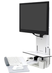
StyleView Sit-Stand Vertical Lift Patient Room 61-080-062 white Patient Room 61-080-085 black High Traffic Area 61-081-062 white High Traffic Area 61-081-085 black