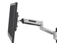
LX Sit-Stand Wall Arm 45-353-026 polished aluminum HD 45-383-026 polished aluminum