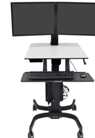
WorkFit™-C LCD LD (Light Duty) 24-215-085 black LCD HD (Heavy Duty) 24-216-085 black Dual 24-214-085 black