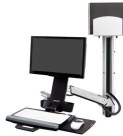
StyleView Sit-Stand Combo System Combo System with worksurface: 45-270-026 Combo Arm, medium CPU holder and wall track, polished aluminum 45-272-026 Combo Arm, small CPU holder and wall track, polished aluminum Combo System: 45-271-026 Combo Arm, medium CPU holder and wall track, polished aluminum 45-273-026 Combo Arm, small CPU holder and wall track, polished aluminum