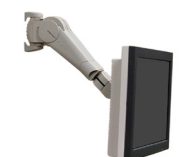
400 Series Wall Mount LCD Arm 45-007-099 grey 45-007-085 black