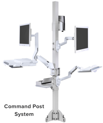
Command Post System