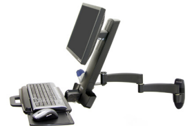
200 Series Combo Arm 45-230-216 white 45-230-200 black