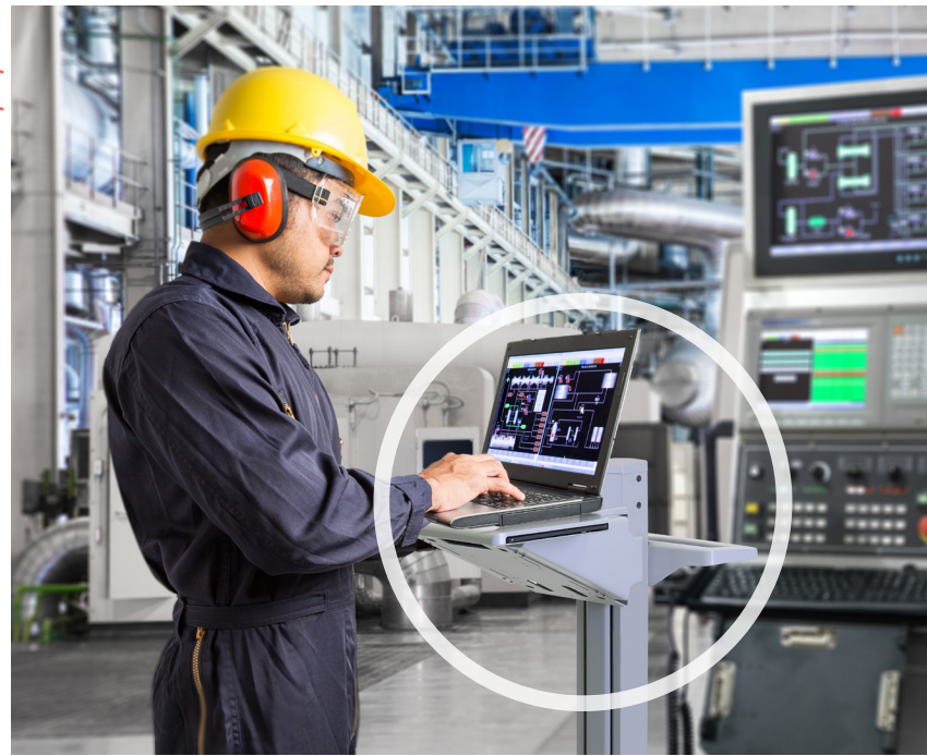
Neo-Flex Laptop Cart