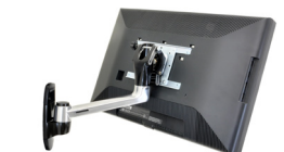
LX HD Wall Mount Swing Arm 45-268-026 polished aluminum Pivot 45-269-009 black