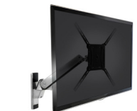
Interactive Arm HD 45-296-026 polished aluminum VHD 45-304-026 polished aluminum