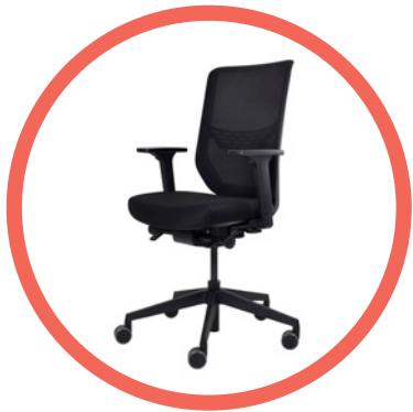
WF Mesh or Upholstered Chair (ANZ) Complete an ergonomic workspace with a personalized resting spot