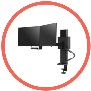
TRACE™ Monitor Mount Effortlessly adapts to each user in shared or individual workspaces