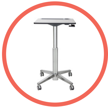
Mobile Desk Moves easily from room to room for individual or group work