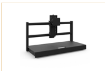
Basic unit measures 32" wide and comes with one monitor knuckle. Add kits to fit your modality.

For the ultimate display control, attach the Monitor Easy Track to your existing table, desk, or countertop. Reduce eye strain by sliding monitors forward and backward in unison with fingertip ease. Customize to your unique modality with optional kits to hold up to 6 displays. Fine-tune monitors (vertical, lateral, and side-to-side tilt) to align and angle seamlessly.