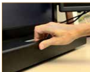
Slide the entire bank of monitors in unison to the focal depth you need.