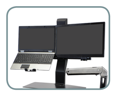
WORKFIT CONVERT-TO-LCD & LAPTOP KIT FROM DUAL DISPLAYS 97-617