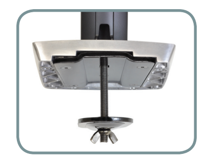
OPTIONAL GROMMET MOUNTING HARDWARE INCLUDED FOR ELEXIBLE MOUNTING