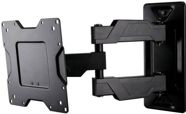
Models: OM80FM and OC80FM