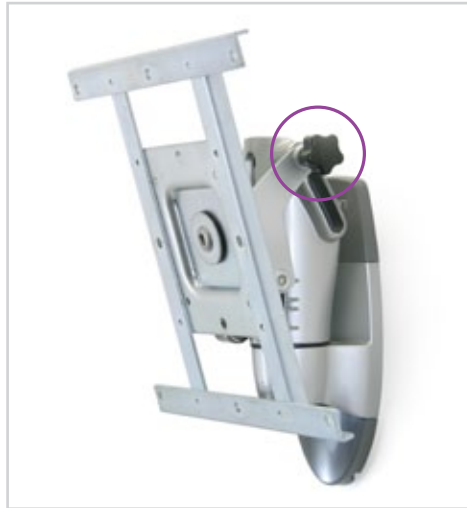
Tilt lock-down feature also provides tilt tension for odd-sized displays that have an extremely forward center of gravity