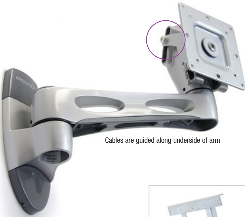
Cables are guided along underside of arm

Sleek and strong—Neo-Flex HDs have been tested to four times their maximum weight capacity as required by UL Standard 1678 (do not exceed 50 lbs in actual use)