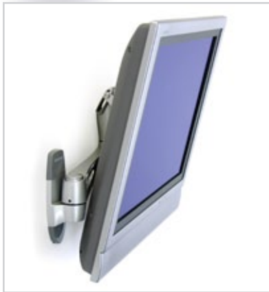
Arm folds flat against wall