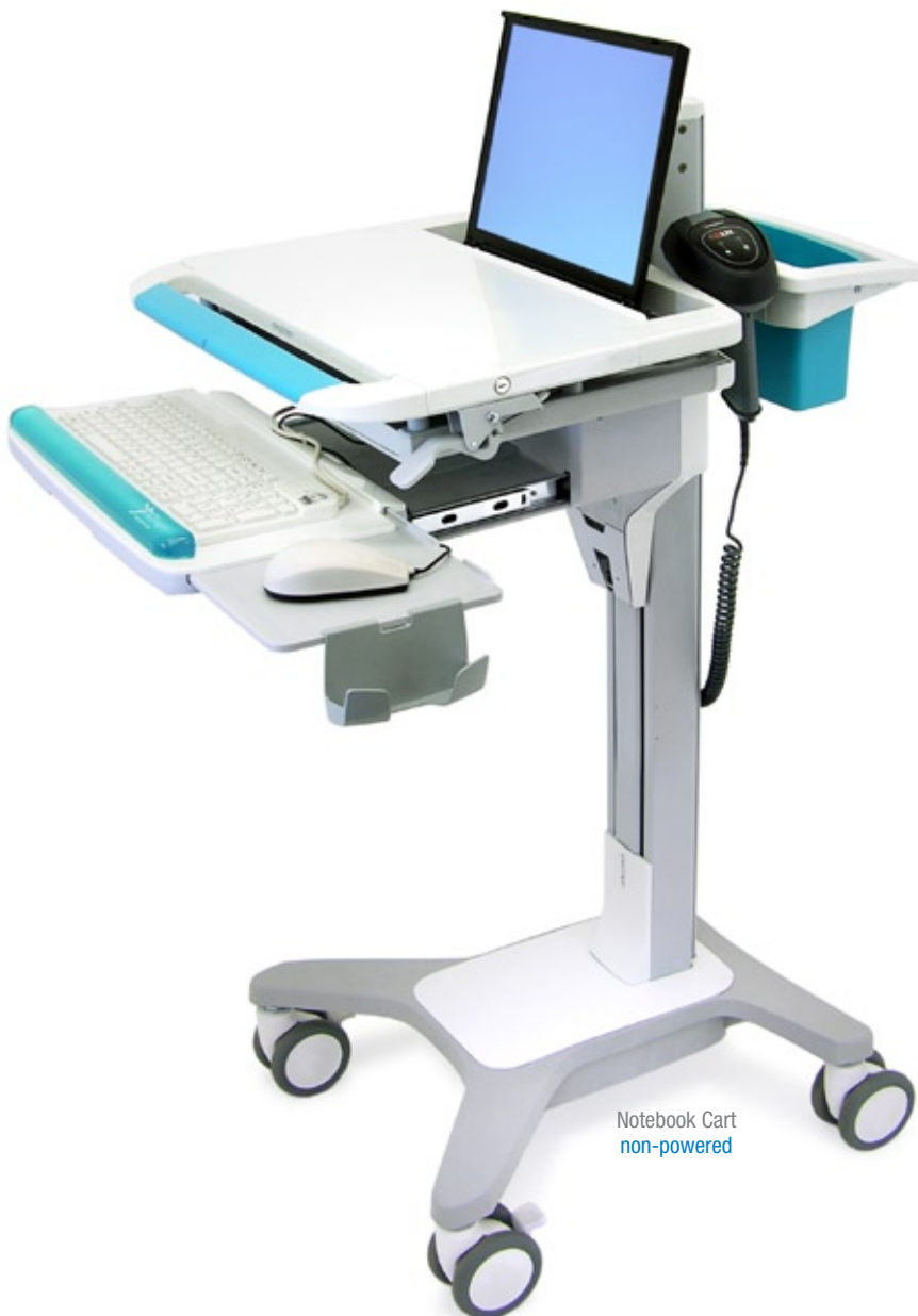
Notebook Cart non-powered