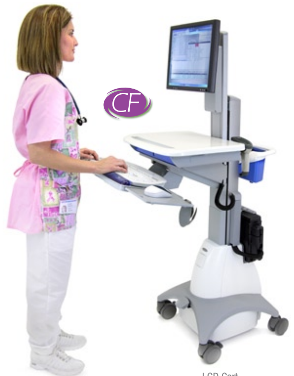
LCD Cart powered